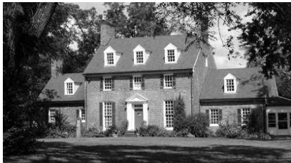
Green Spring Gardens Park 4603 Green Spring Road Alexandria, VA 22312 703-642-5173