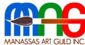
Exhibit: Manassas Railway Festival June 4, 2011

http://www.winsornewton.com/products/brushes/care-and-cleaning-of-brushes/